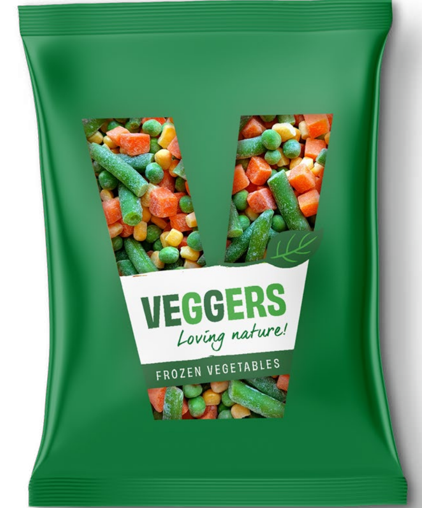
IQF 4-WAY MIX