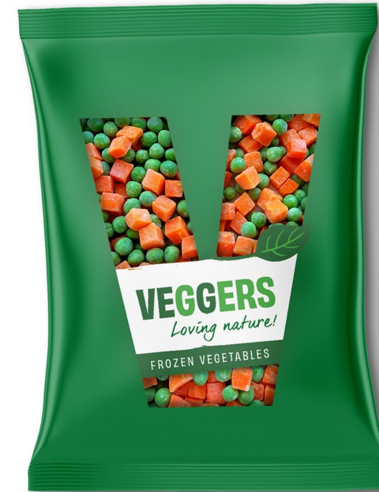
IQF PEAS & CARROTS