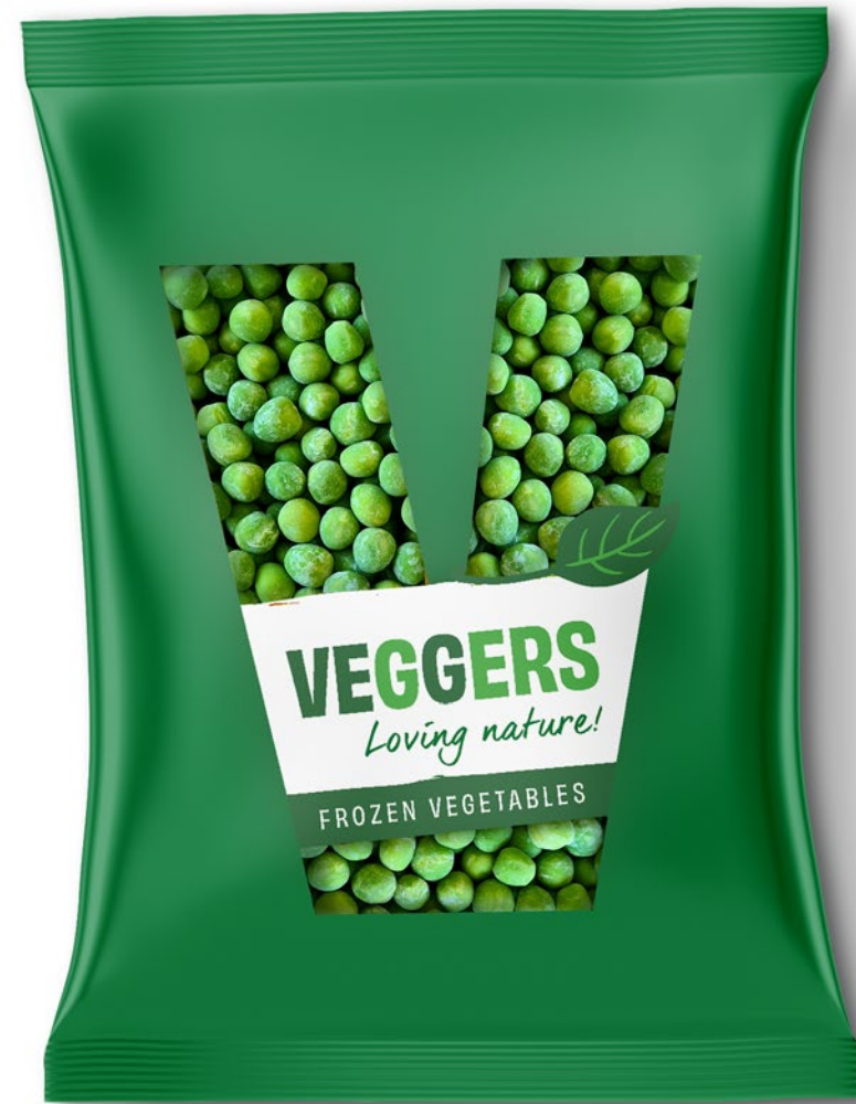
IQF GREEN PEAS