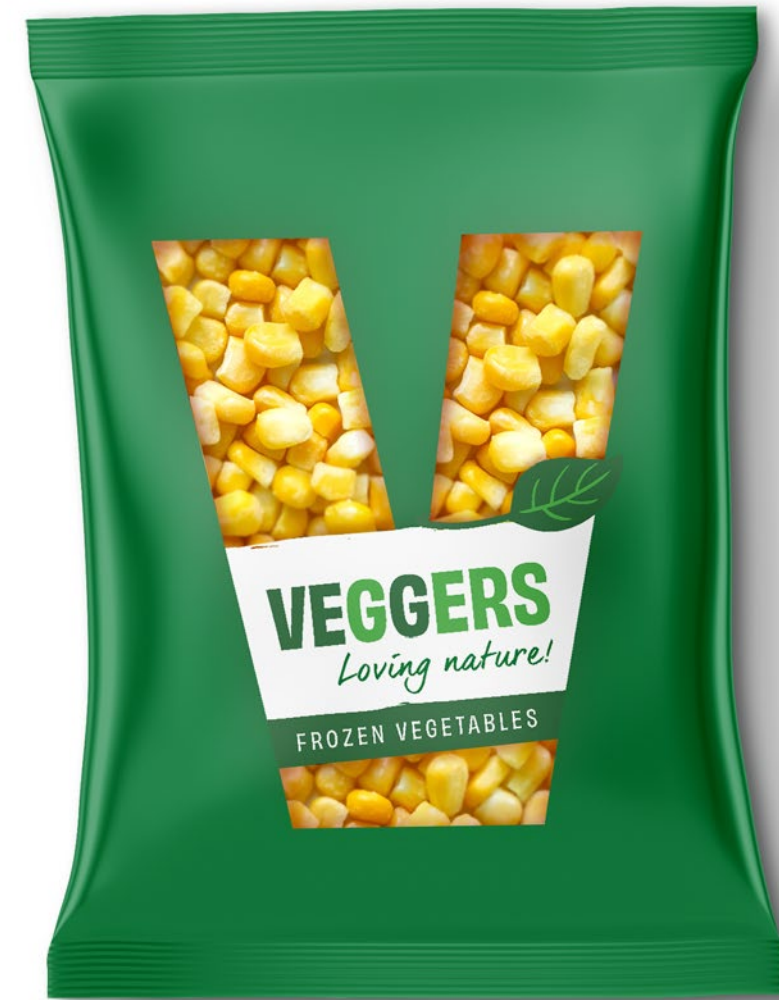
IQF SUPERSWEET CORN