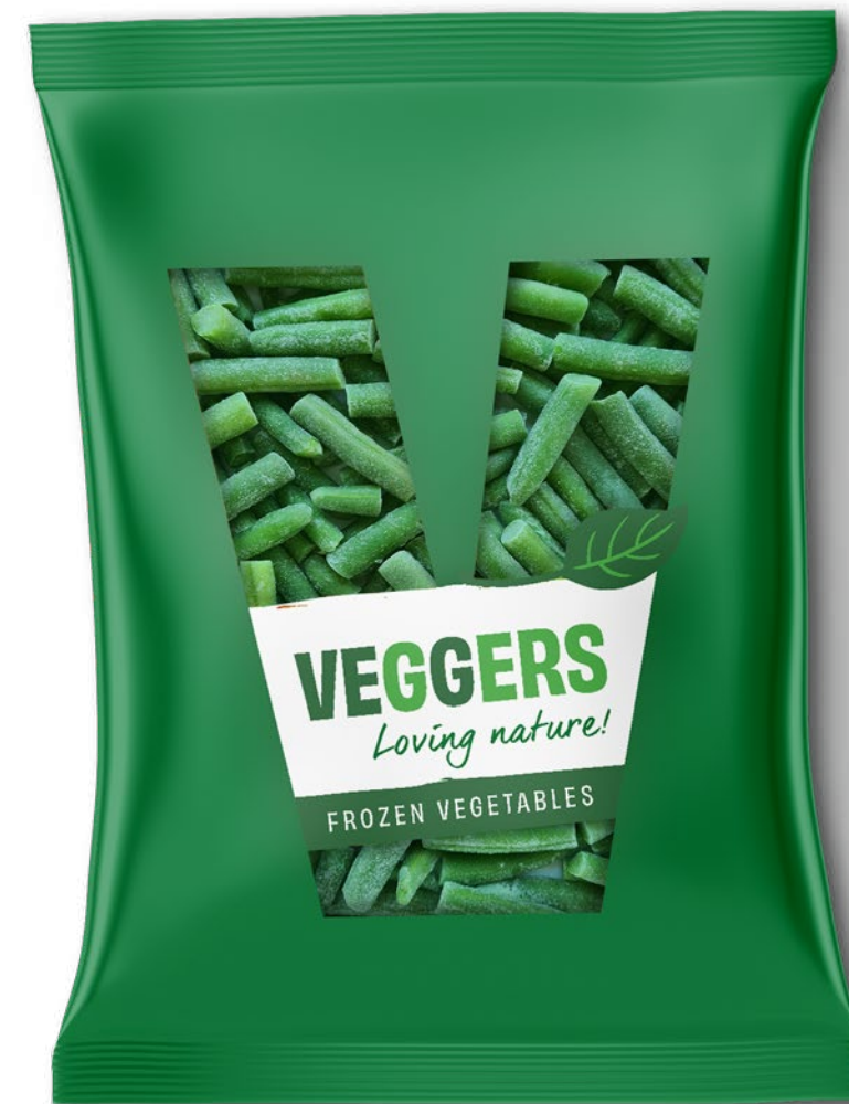
IQF GREEN BEANS CUT